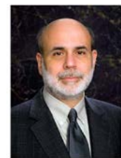
Ben S. Bernanke Chairman Board of Governors 2006 - 2014