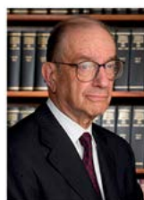
Alan Greenspan Chairman Board of Governors 1987 - 2006