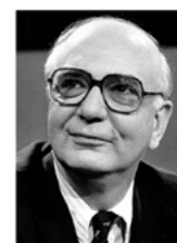
Paul A. Volcker Chairman Board of Governors 1979 - 1987