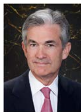
Jerome H. Powell Chair Board of Governors 2012 -

Over the last 50 years, the importance and profile of the central bank leaders have risen to the extent that they have become celebrities. Paul Volcker, the Fed's Chairman from 1979 to 1987, was a well-known hawk. He took charge at the end of a very economically challenging period during the 1970s, with high inflation damaging growth and jobs. 3