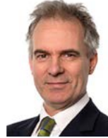
Ben Broadbent Deputy Governor, Monetary Policy