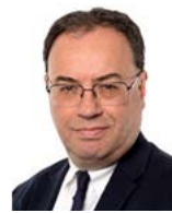
Andrew Bailey Governor, Bank of England